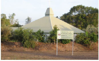
St Luke's, Weipa